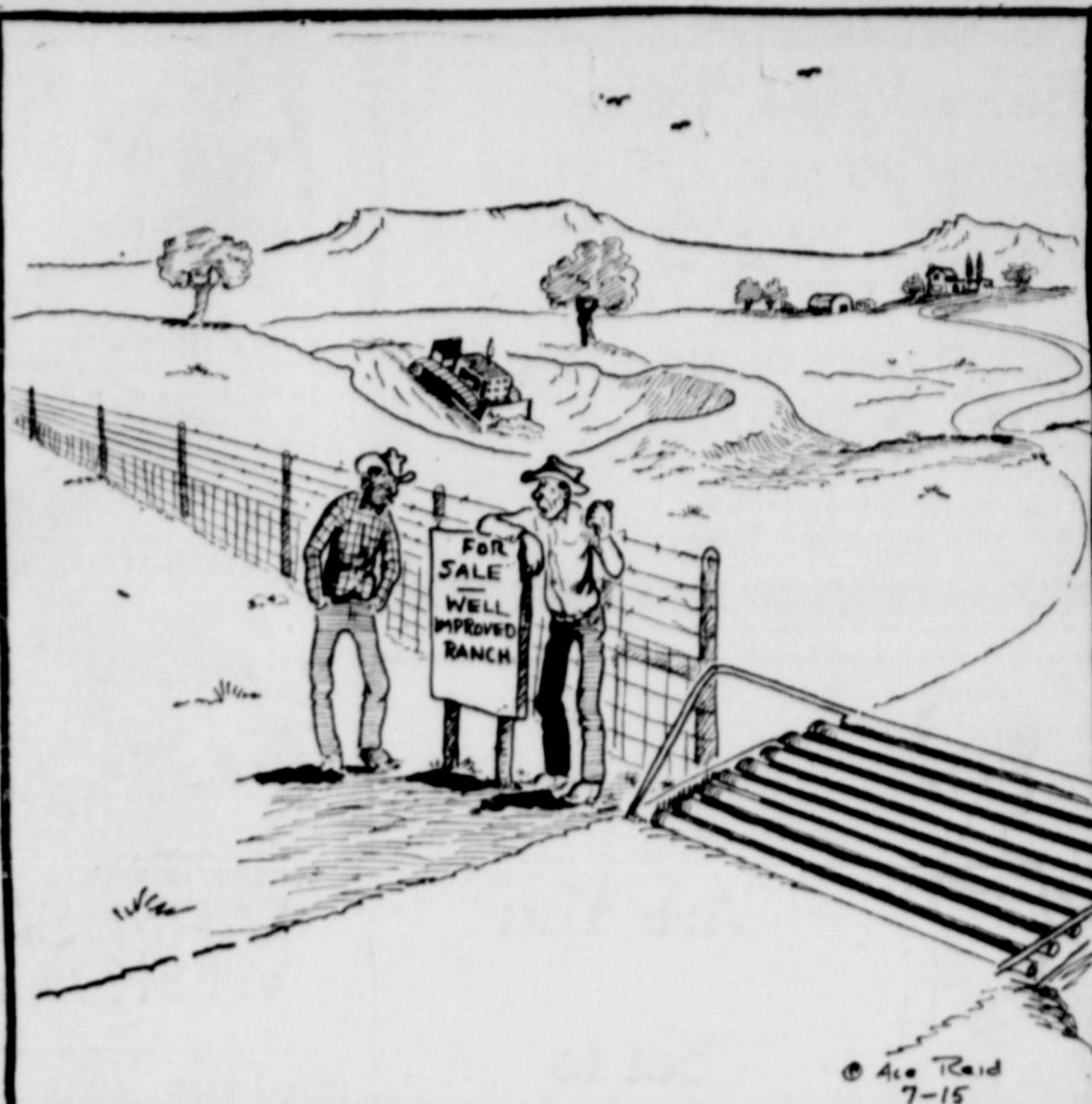
"Yep, it's so well improved, I've gotta sell to pay for the improvements!"