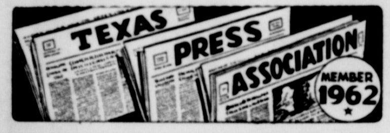
Hico, Texas, Friday, May 18, 1962.

SUBSCRIPTION RATES In Hico trade territory, One Year $2.00; Outside Hamilton, Bosque, Comanche and Erath Counties, One Year, $2.50; Out of State, One Year, $3.00. (Additional charge for short term subscriptions.) All cash in advance.