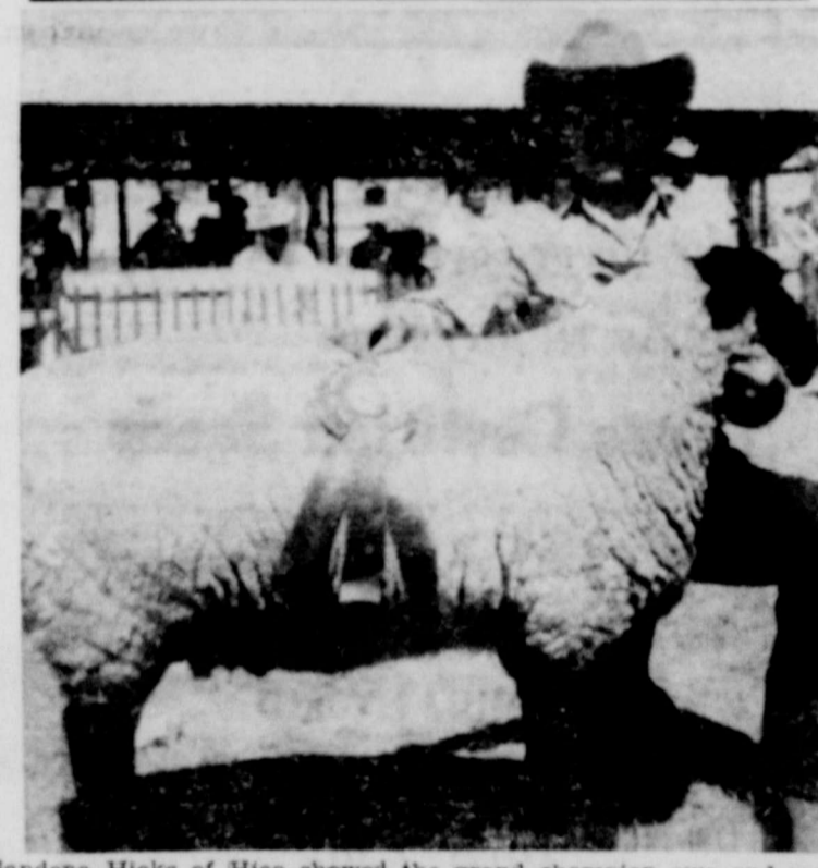
Sandena Hicks of Hico showed the grand champion ewe and ram in the Suffolk Division at the Hico show last week.