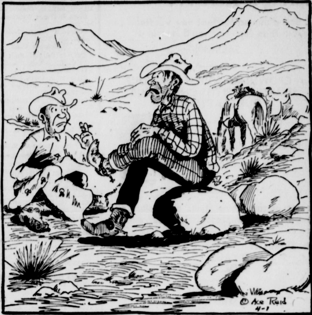
Other than the million dollars worth of experience I've had in ranchin', I ain't made two bits.