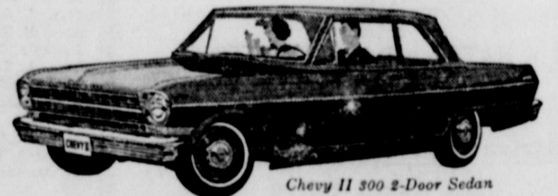
Chevy II 300 2-Door Sedan

Step right up and meet the latest version of the car that's proved its mettle in the fiercest competition going—'62 Corvair. Bigger new brakes team up with Corvair's renowned rear-engine traction for just about the surest footed going on the road. A new Monza Station Wagon makes its debut. And all models sport freshly tailored upholstery inside matched by sassy new styling accents outside.