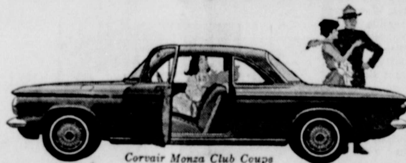
Corvair Monza Club Coupe