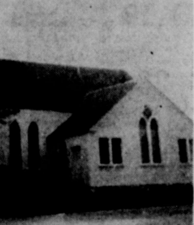
FIRST METHODIST CHURCH . . . before building program.

A fund drive for the recently organized Girl Scout Troops in Hico has been scheduled for the week of October 2 through October 7. An initial fund is needed for the organization to operate and expand their activities. Adult leaders accompanied by Scout members will solicit all homes and businesses in Hico and neighboring communities from 4 to 6 p.m. October 2 through 6, and from 8 a.m. to 6 p.m. Saturday, October 7. Only the one fund drive is scheduled for the organization, with future finances being derived from their projects. The Girl Scout program is available to all girls between the ages of 7 and 17 and at present there are 50 girls enrolled in the three divisions of Brownie, Intermediate and Senior. "Under adult leadership, the