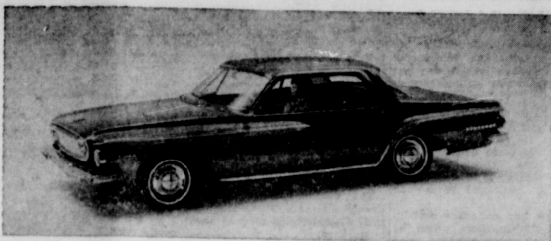
NEW LOOK FOR DART —Dodge's popular-price Dart is dramatically restyled for 1962. Dodge engineers say the new Dart features a new concept in standard-size car design which provides the owner with greater performance, economy and ease of handling. All useless weight and extra size has been "engineered out," they say. Pictured above is the deluxe Dart "440" four-door hardtop.