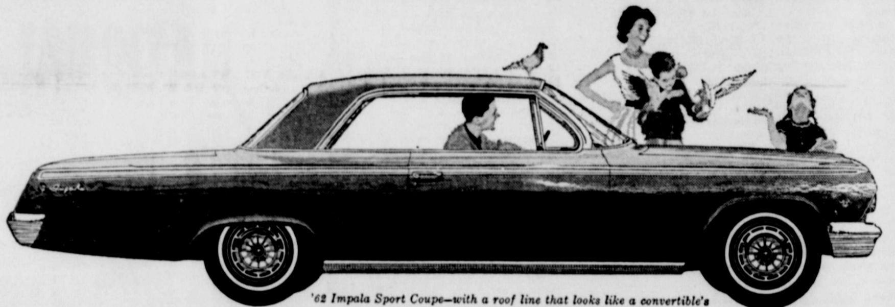
'62 Impala Sport Coupe—with a roof line that looks like a convertible's

A New World of Worth from Chevrolet for '62!