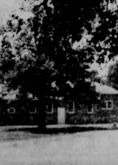
FIRST METHODIST CHURCH . . . after remodeling and addition.