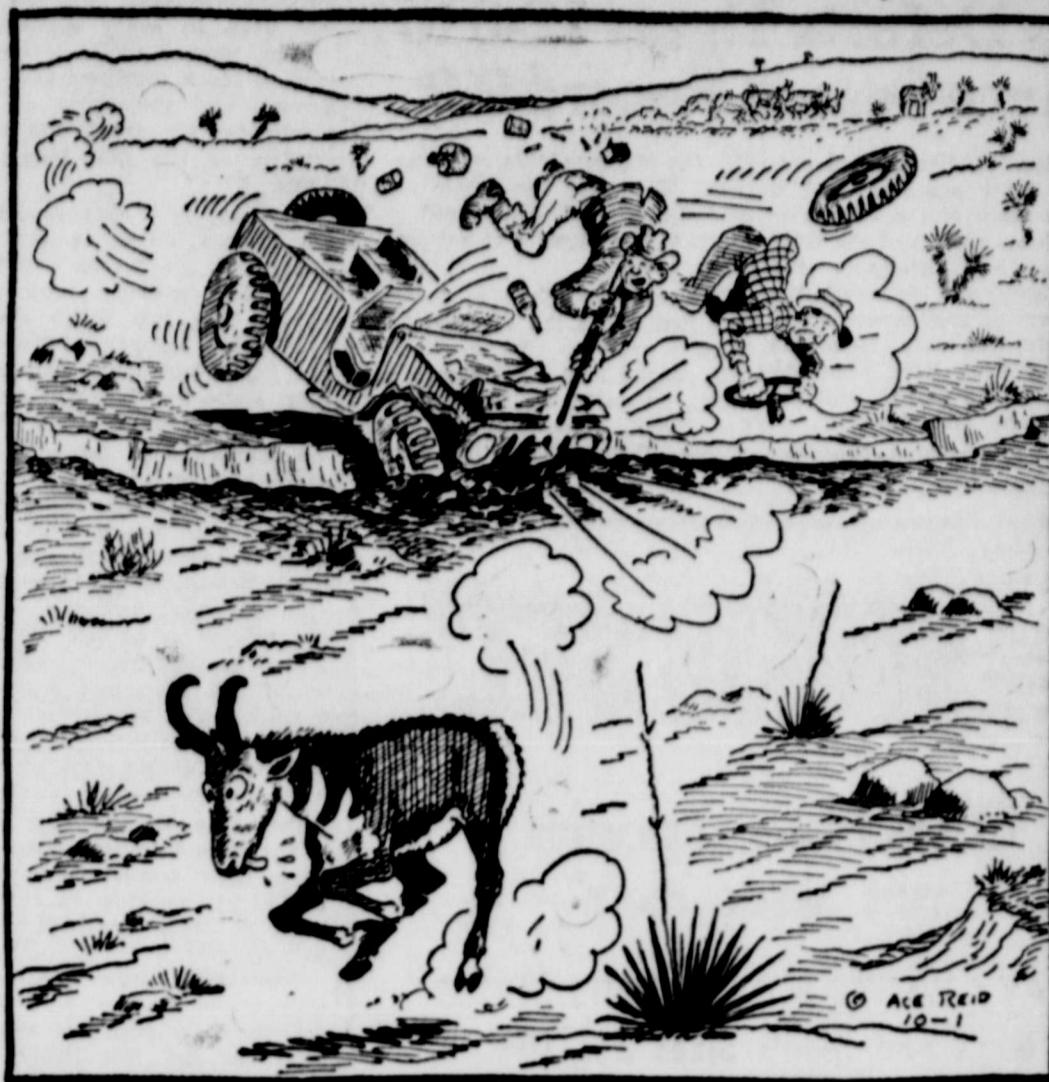
Hold'er steady jist a little longer. I've got a perfect bead on him!