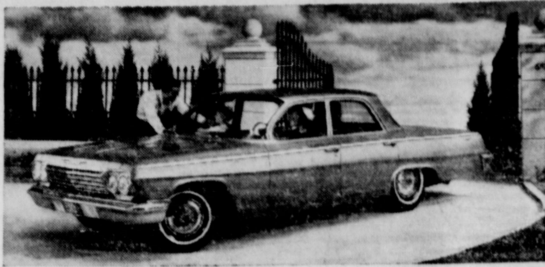
A distinctively new styling touch in both the front and rear end of the 1962 Chevrolets is a sharp departure from the sloping hood formerly used. The Bel Air 4-Door Sedan with twin wind-splits on the hood is one of 14 new standard size passenger cars offered by Chevrolet in '62. The Bel Air models are exquisite, with new luxurious interiors and appointments. A new Chevy II series will also be shown by Chevrolet dealers when the 1962 passenger car lines go on display Sept. 29.

Had a visitor? Been some place? Then call in your news items each week.