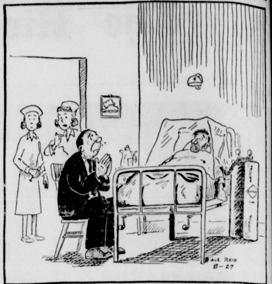
No, that ain't his Preacher prayin'. It's his Banker!