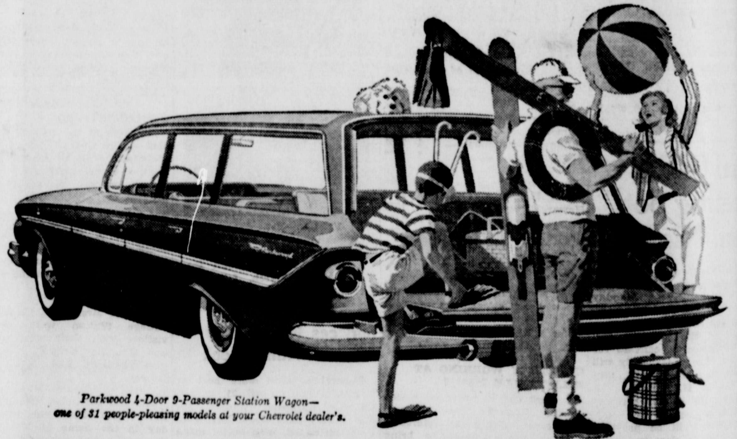
Parkwood 4-Door 9-Passenger Station Wagon— one of 31 people-pleasing models at your Chevrolet dealer's.