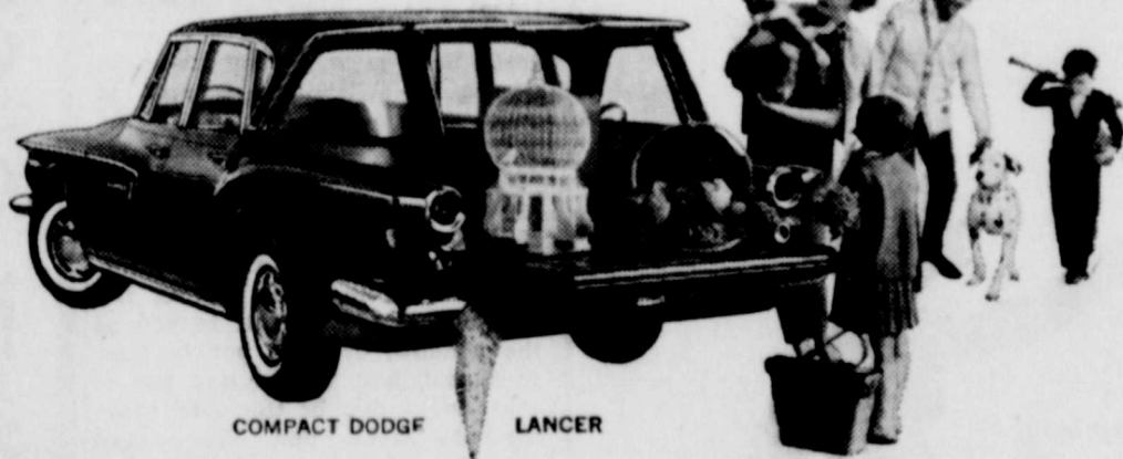
COMPACT DODGE LANCER

MOTHERS, FATHERS, BOYS, GIRLS, CATS, CANARIES, BOUQUETS,