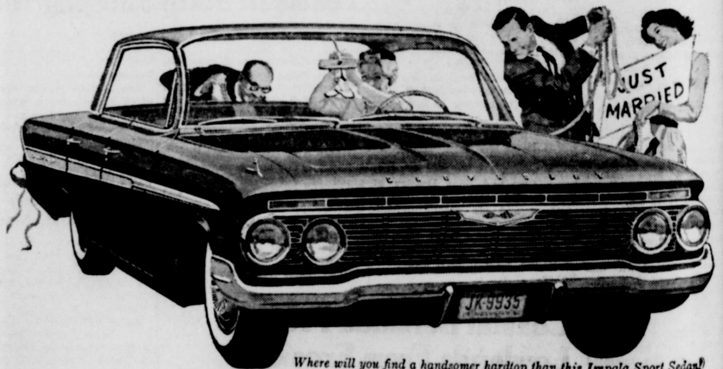
Where will you find a handsomer hardtop than this Impala Sport Sedan?