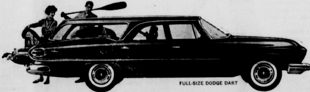
FULL-SIZE DODGE DART

MOTHERS, FATHERS, BOYS, GIRLS, CATS, CANARIES, BOUQUETS,