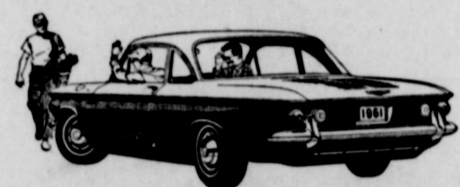
New lower priced '61 CORVAIR 700 CLUB COUPE

Here's a new measure of elegance from the most elegant Chevrolets of all. There's a full line of five Impalas—each with sensible new dimensions right back to an easier-to-pack trunk that loads down at bumper level and lets you pile baggage 15% higher.