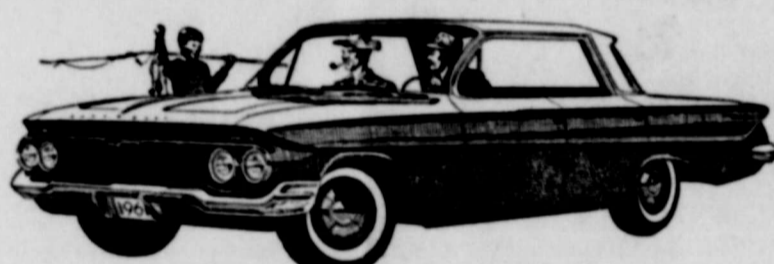
New '61 Chevrolet BEL AIR SPORT SEDAN

There's a whole crew of new Chevy Corvairs for '61—polished and perfected to bring you spunk, space and savings. Lower priced sedans and coupes offer nearly 12% more room under the hood for your luggage—and you can also choose from four new family-lovin' wagons.