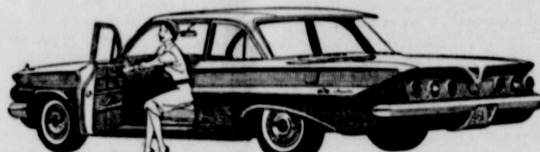
New '61 Chevrolet IMPALA 2-DOOR SEDAN

There are six easier loading Chevrolet wagons for '61—ranging from budget-pleasing Brookwoods to luxurious Nomads. Each has a cave-sized cargo opening measuring almost five feet across and a concealed compartment for stowing valuables (with an optional extra-cost lock).