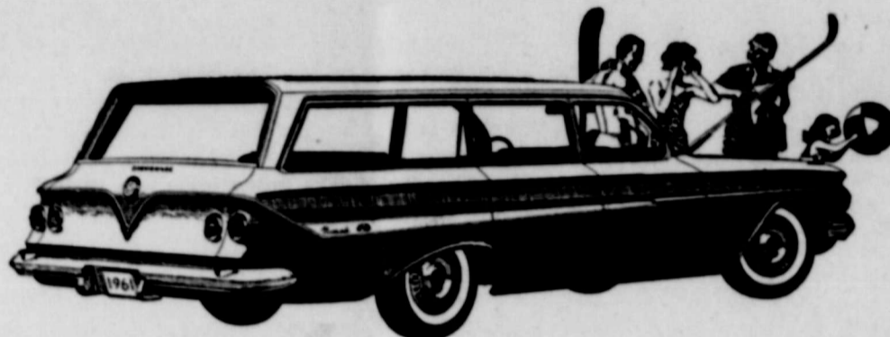
New '61 Chevrolet NOMAD 9-PASSENGER STATION WAGON

There are six easier loading Chevrolet wagons for '61—ranging from budget-pleasing Brookwoods to luxurious Nomads. Each has a cave-sized cargo opening measuring almost five feet across and a concealed compartment for stowing valuables (with an optional extra-cost lock).