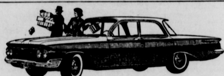
New '61 Chevrolet 4-DOOR BISCAYNE 6

Beautiful Bel Airs, priced just above the thriciest full-size Chevies, bring you newness you can use: larger door openings, higher easy-chair seats, more leg room in front, more foot room in the rear, all wrapped up in parkable new outside dimensions.