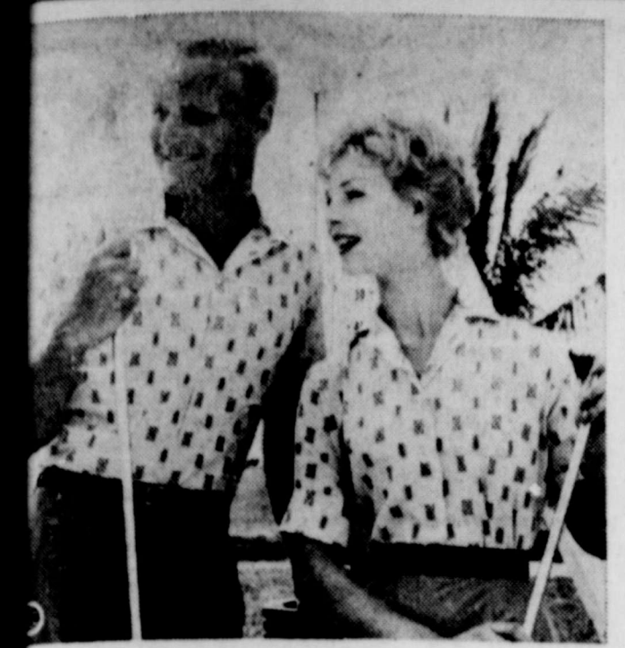
S IN A POD-A sporting twosome are these "his-and-"sport shirts by Arrow. Both are styled along almost atical lines in a handsome printed combed cotton. For that inine touch, hers has deep cuffs. And for carefree launder-both are completely wash and wear.