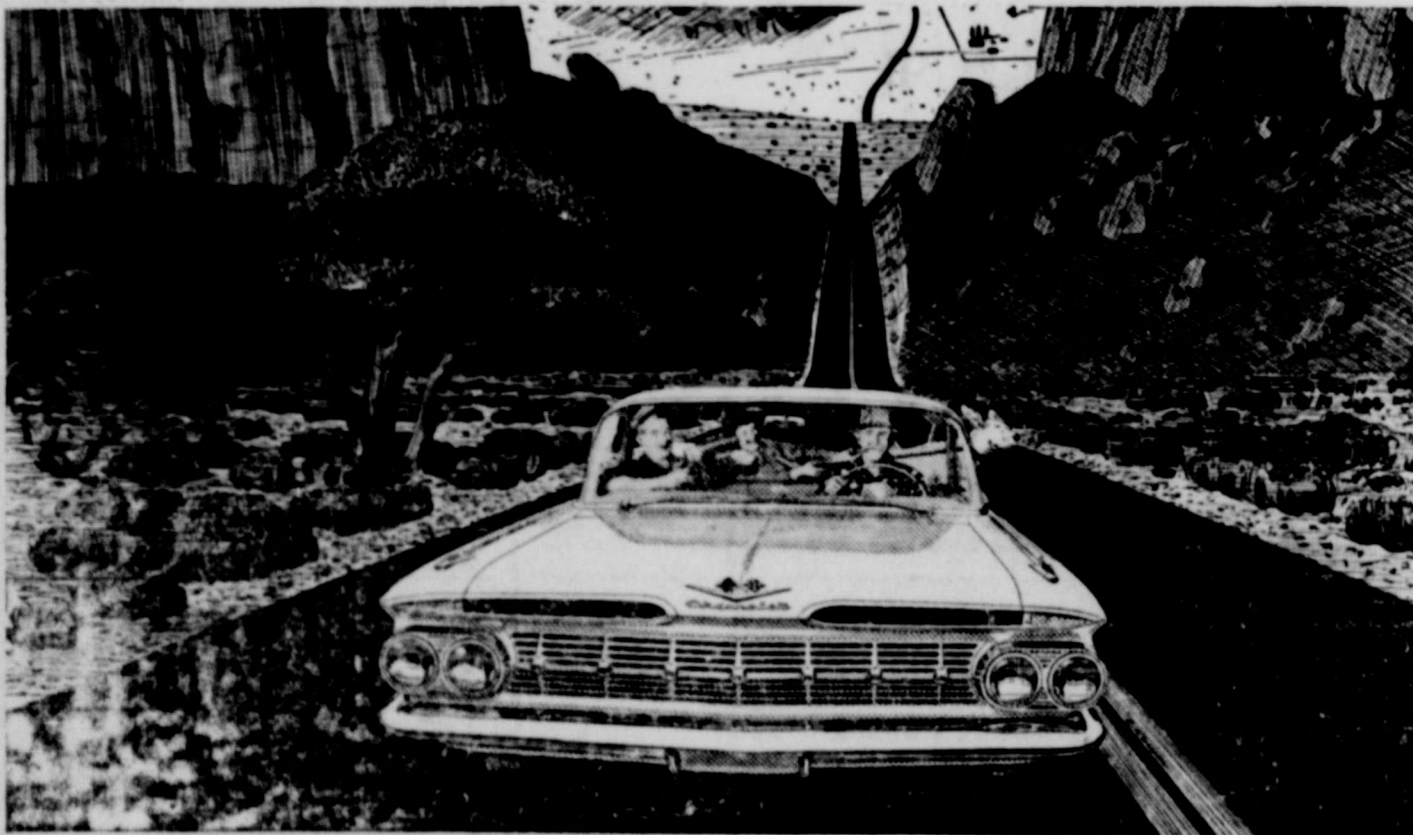
Chevrolet's exuberant Impala 4-Door Sedan