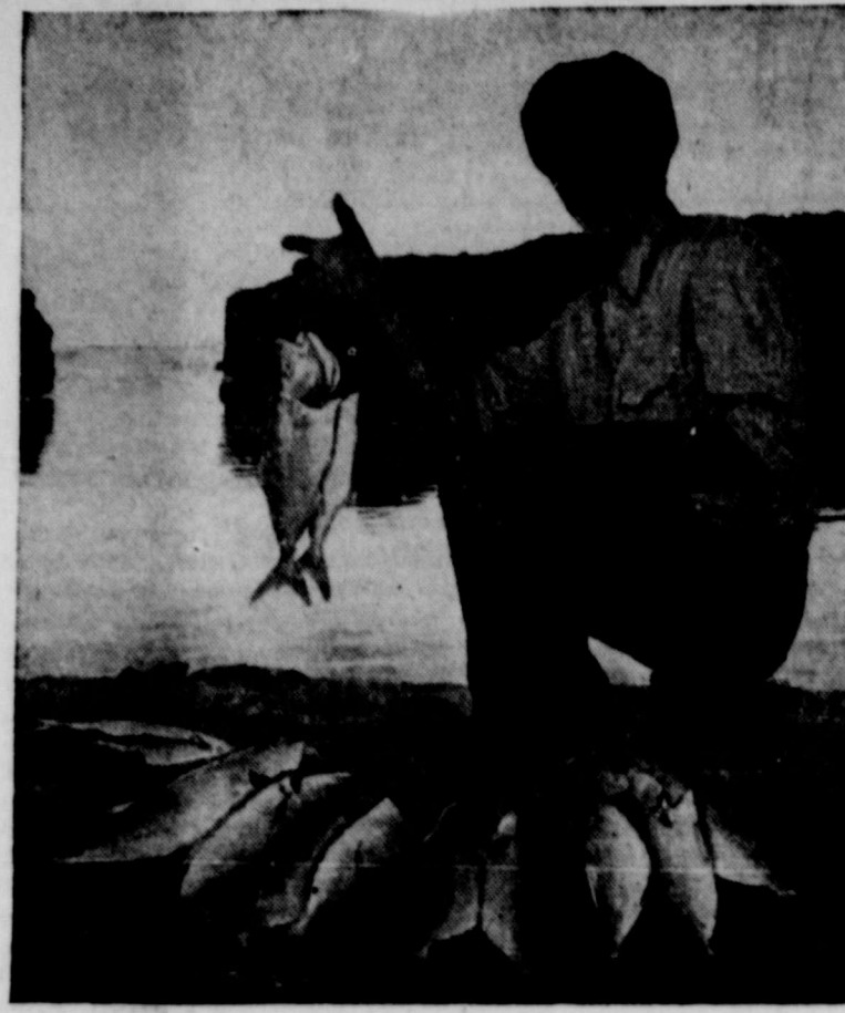
BERMUDA CATCH: Old salt displays mess of tasty jacks he's caught from dockside in Somerset Village in the western Bermudas. The great variety of fish that swim the waters of the mid-Atlantic resort make it one of the world's great sports fishing centers. Appropriately enough, the 22-mile long island chain is shaped in the form of a giant fishhook.

WANTED: Lady to work at driveway. Capable to cook and wait on front. Experience not required. Write P.O. Box 36 Hico. 10-1tp