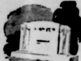
Ageless Symbol of Enduring Love

RILEY-GARDNER Memorial Co. HAMILTON, TEXAS