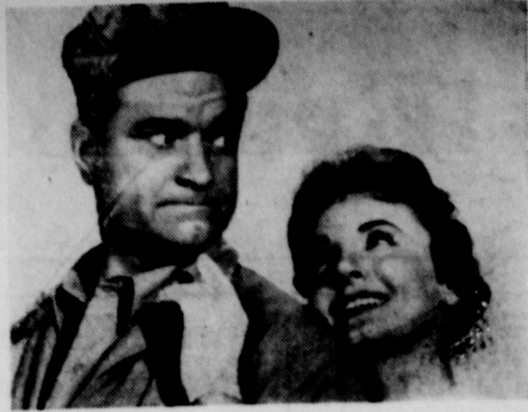
Pretty Janet Blair tweaks her car-zy sweetheart, Red Skelton, under the chin. The two star in "Public Pigeon No. 1" Friday and Saturday at Hico Theatre.

This is a subtle role for he-man Ladd who plays a straight-laced earnest archeologist caught between his duty to the Greeks and the physical attraction of the disarmingly naive Miss Loren.