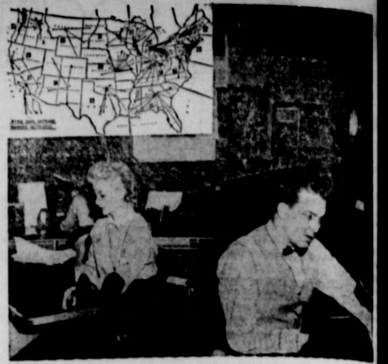
CIVIL DEFENSE 'KEYPOINT' for Los Angeles is typical of some 200 such communication centers throughout the nation maintained by local civil defense. In less populous areas, "keypoints" are often police or fire stations, where someone is always on duty. They depend on the Federal Civil Defense Administration's 14,116-mile warning net (inset) to link them to Air Force air defense division control centers. Keypoints notify, in turn some 3,500 "sub-keypoints" which set off sirens and call out civil defense personnel.