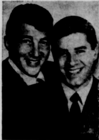
Dean Martin and Jerry Lewis will be seen in their last picture made together, at the Hico Theatre, May 16-17. The film is the much-talked about "Hollywood or Bust."