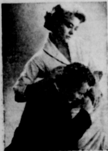
She wasn't his wife... he wasn't her husband... it was a love that could never be. Dorothy Malone has a cowardly sheriff for a husband... Richard Egan is a hero running away from his past in "Tension At Table Rock," playing Friday and Saturday at Hico Theatre.

performance in a growing list of hit dramatic roles which keep him at the pinnacle of Hollywood stardom. Miss Bacall is at her best in the part of a sophisticated woman who attracts all types of men and her svelte beauty enhances the hard-hitting emotional sequences. Stack makes the most out of the best acting opportunity of his career. His portrayal of the profligate heir to a vast oil empire is definitely of Academy Award stature. As an intelligent young man of weak character, Stack brings a psychotic of the most futile kind to the screen. There probably has never been a more abandoned creature portrayed on the screen than that played by Dorothy Malone as Stack's sister whose mind is on one thing only, men, and on one man in particular, Rock Hudson. Her characterization of the wanton daughter of wealth and leisure makes her another likely candidate for Academy Award consideration.