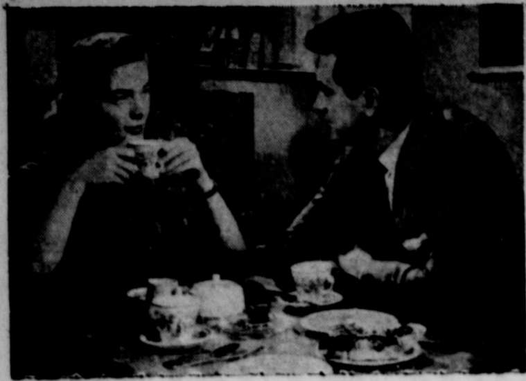
Lauren Bacall and Rock Hudson have a friendly chat over the lunch table in this scene from "Written on the Wind," exciting drama, which co-stars this pair of players and Robert Stack and Dorothy Malone, playing Saturday midnight, Sunday and Monday at the Hico Theatre.