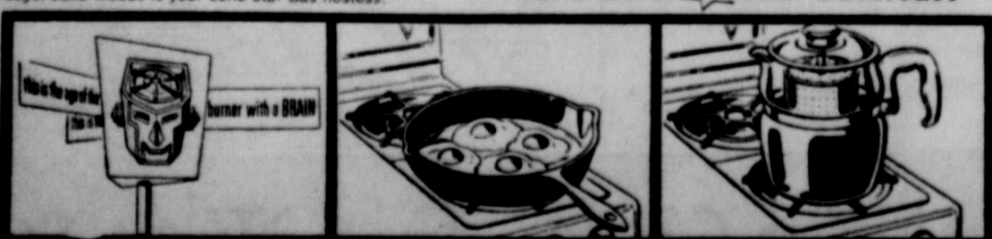
FLOOR DISPLAY. Look for the dealer with this display - cause that's where you'll find burner with a brain gas ranges.

Watch Playhouse 90 over CBS television, Thursdays. Julia Meade is your Lone Star Gas hostess.