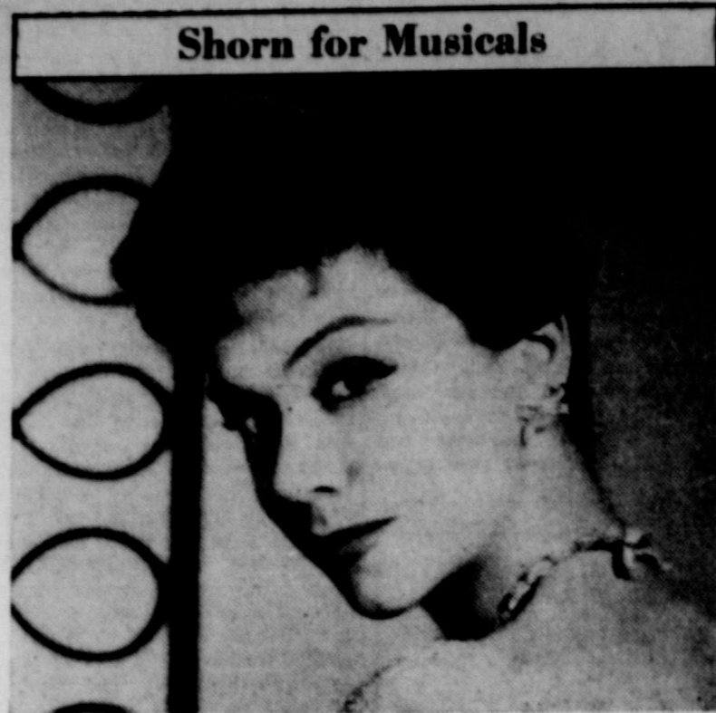
Patrice Munsel, noted almost as much for her lovely long tresses as for her glorious soprano voice, has cut her hair for her role of "Nellie Forbush" in the State Fair Musicals' 1957 production of "South Pacific." Miss Munsel who entranced audiences in the title role of "Naughty Marietta" for the Musicals two years ago, also appears next month in the State Fair Auditorium with the Metropolitan Opera Company.