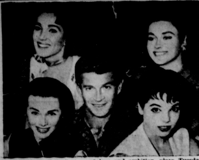
"Four Girls in Town," story of love and ambition, plays Tuesday, Wednesday, and Thursday at Hico Theatre