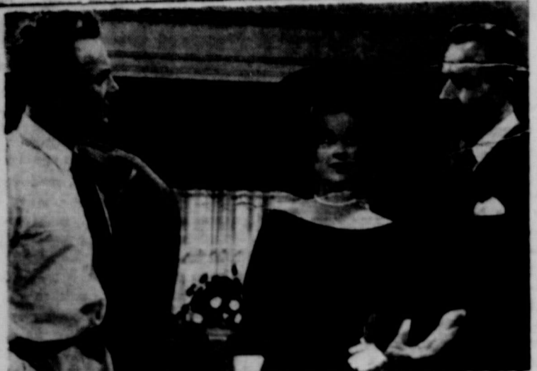
Van Johnson stars in "Kelly and Me" Friday and Saturday at Hico