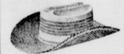
The Appalcoosa+ $5