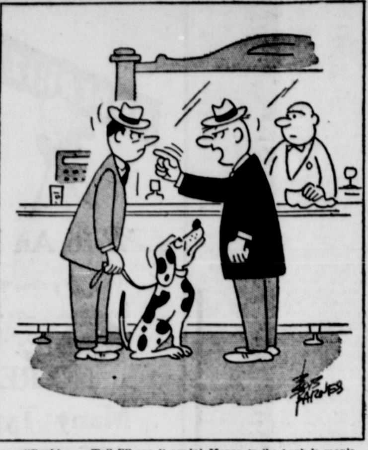
"Yeah! . . . Well I'll say it again! Money in the bank is man's