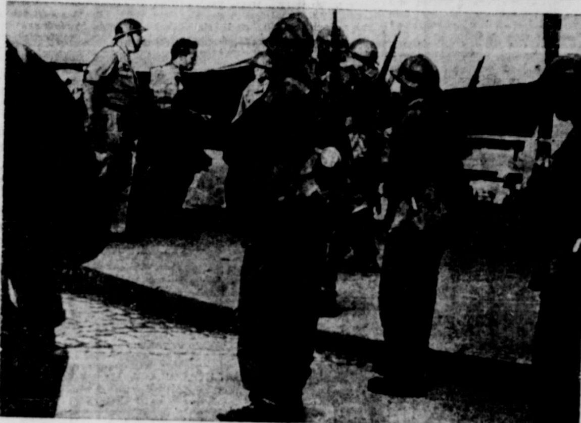
UNREST IN MOROCCO... Soldiers of Morocco's new sultan, Sidi Moulay Mohammed Ben Arafa, patrol streets of capital city Rabat...