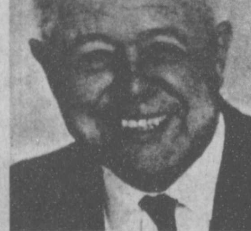
W. R. POAGE