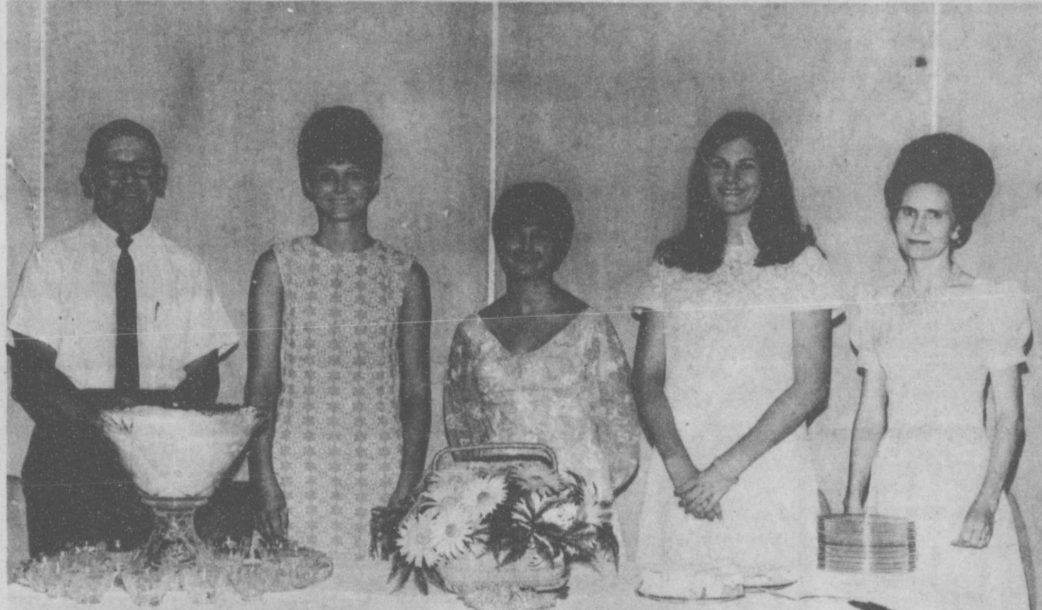
FARM BUREAU VIP'S