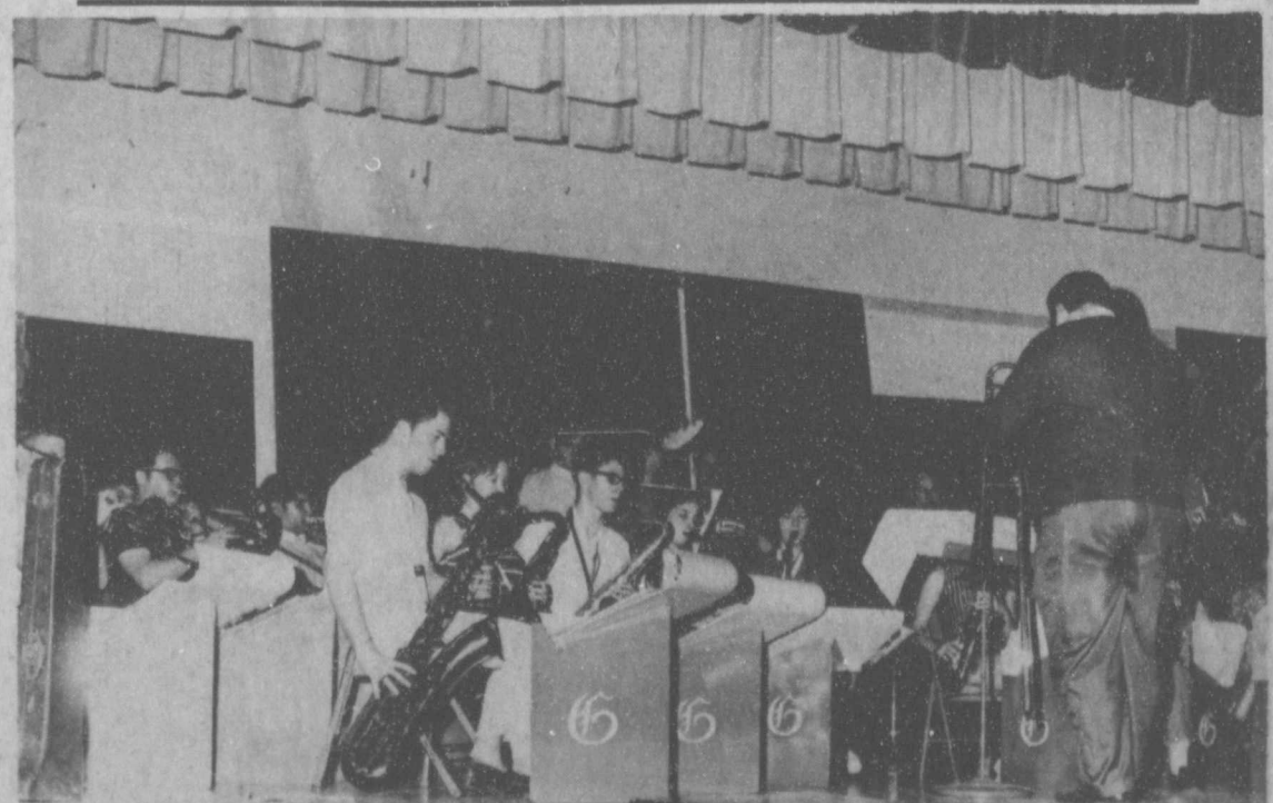
"Swinging Safari" starts tonight at the Gatesville High School Auditorium at 8:00 p.m. The thirteenth annual show performed by the Gatesville High School Band will feature original skits and entertainment of the over 90 students. The GHS Stage Band will provide the musical score for the evening. An evening worth the time.