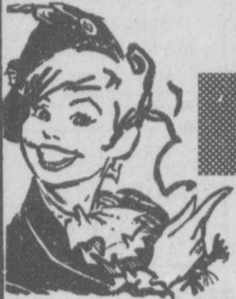
BONNIE, THE PLAID LASSIE