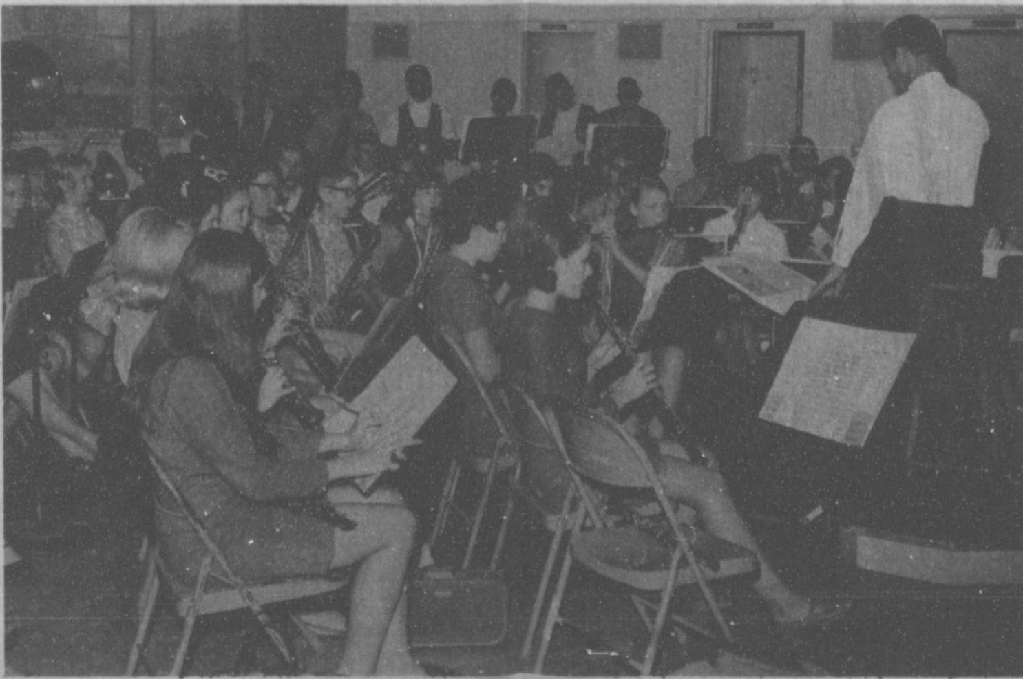
GHS Band Practice