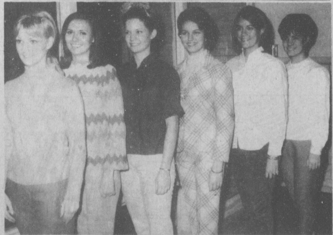
Gatesville Lions Club Nominates Sweethearts

The Jonesboro men have been in the swine business for six years.