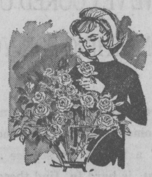
They Say, 'Happy Birthday'

Special occasions such as birthdays or anniversaries just naturally call for flowers . . . flowers are so festive so appropriate! We also feature attractive potted plants for gifting .... come in today!