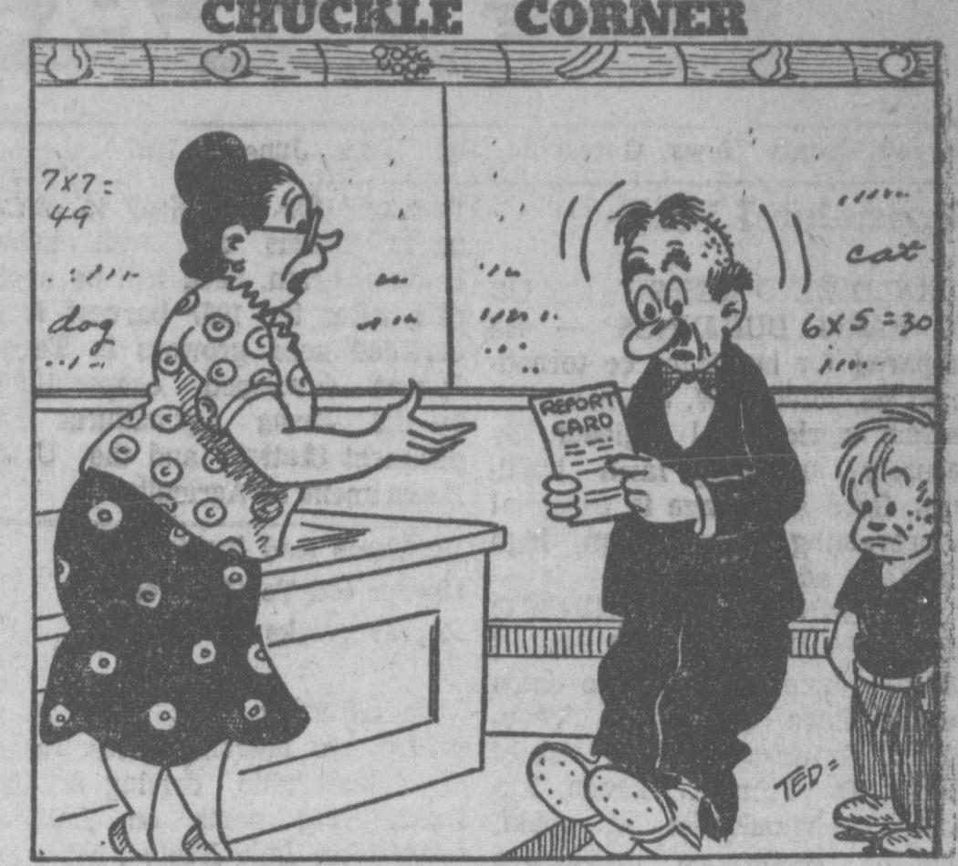
"YOUR SON IS LEADER OF THE CLASS, SIR! HE LEADS ALL THE OTHER PUPILS IN LOWEST MARKS!

Coryell County News, Gatesville, Tex., Tues., June 13, 1967