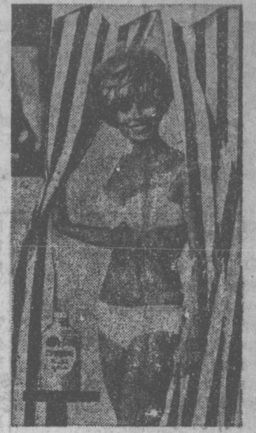
WAY TO SUN-FUN-Jill St. John wisely selects a suntan product to match her skin type. Jill co-stars in "Banning" for Universal Pictures.

4. RIGHT LOCALE—The most relaxing place for sunbathing is your own patio. If at a public pool or beach, spend part of your time in the shade. Remember, too, that you can get a sunburn on an overcast day.