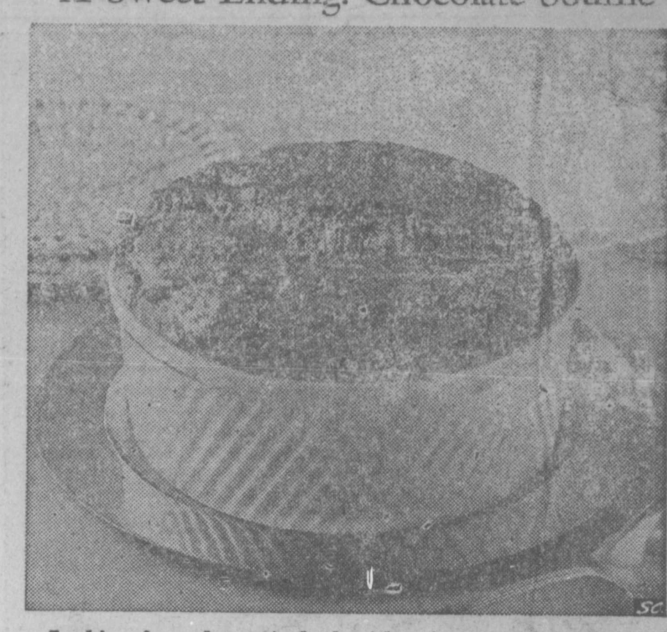
Looking for a dramatic finale either for a party or a special family dinner? A crusty sweet Chocolate Souffle made with the magic of sweetened condensed milk may be the answer. Bake slowly and thoroughly, the Borden Kitchen advises, then serve immediately either plain or crested with heavy cream. Chocolate Souffle