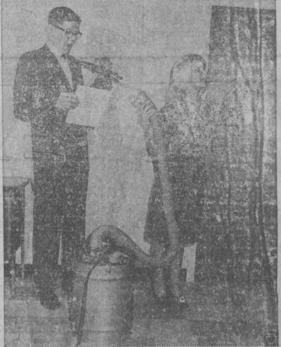
It's easy to see who has all the pull around here. The mighty little industrial type vacuum cleaner with a unique mechanism can do the rough, tough jobs that defeat ordinary household vacuums. Ideal for shop, office, garage, work rooms and heavy household duty. Picks up all kinds of debris and surprisingly lowpriced, "Shop-Vac" is a 10-gallon steel drum with motor, hoze and nozzle that develops 1-horse-power and comes out of Wood-Ridge, N. J.