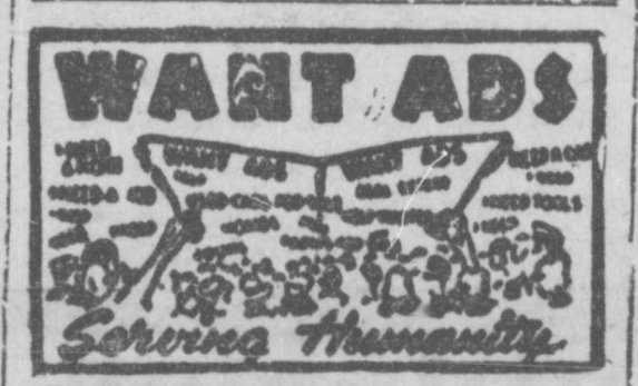
Classified Rates: 2e a word

celestial obects two billion light for any violation thereof. years away.