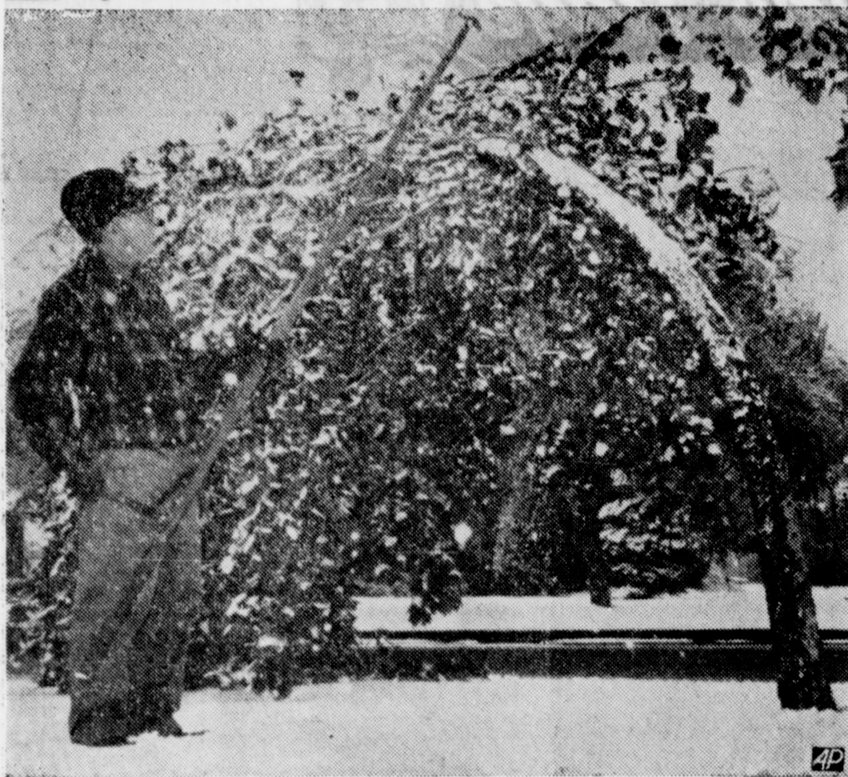
SNOW IN TEXAS—More than four inches of ice and wet snow in Amarillo, Texas, broke or dangerously bent trees and limbs across the city. S. L. Cook clips sagging limbs from his floundering Sycamore tree in an effort to save the tree from possible fractures and abrasions.

t's Now. Coryell County Friends Of The Library: Officers