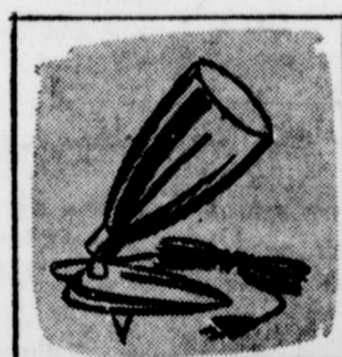
Weatherproof spot and flood lights add both brilliance and shadows.

A FREE BOOKLET filled with Christmas lighting hints is available at our office. Come in for your copy.