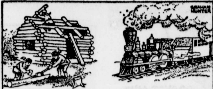
EARLY HOUSING (1750)

12:00 Learn & Live 12:30 The Big Picture 1:00 Modern Science Theatre 1:30 Pro Basketball 3:30 Ask Washington 4:00 Post Time 4:30 Bugs Bunny 5:00 Industry on Parade 5:15 Saturday News NBC 5:30 Dub King Scoreboard 6:00 Best of the Post 6:30 Wells Fargo 7:3 The Tall Man 8:00 Sat. Night At The Mivies 10:00 Channel 6 Report News 10:10 Channel 6 Report Weather 10:15 Late Date Theatre SUNDAY 12:30 Frontiers of Faith 1:00 Pro Football 3:30 You and Your Doctor 4:00 Wisdom 4:30 Chet Huntley Reporting 5:00 Meet The Press 5:30 1-2-3 Go 6:00 Bullwinkle Show 6:30 Wonderful World of Color 7:30 Car 54, Where Aae You? 8:00 Bonanza 9:00 Show of the Week 10:00 Channel 6 Report News 10:10 Channel 6 Report Weather 10:15 Late Date Theatre MONDAY 6:30 National Velvet 7:00 Donna Reed Show 7:30 Price Is Right 8:00 87th Precinct 9:00 Thriller 10:00 Ch. 6 Report World News 10:08 Ch. 6 Report State & Local 10:16 Ch. 6 Report Weather 10:24 Ch. 6 Report Sports 10:30 Jack Paar Show NBC TUESDAY 6:30 The Good Ship Hope 7:30 Alfred Hitchcock 8:00 Dick Powell Show 9:00 Cain's Hundred 10:00 CH 6 Report World News 10:08 CH 6 Report State & Local 10:16 CH 6 Report Weather 10:24 CH 6 Report Sports 10:30 Jack Paar Show (C)