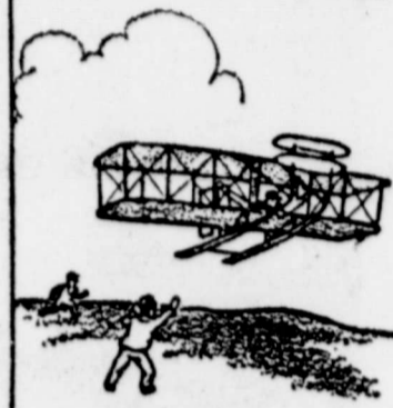
SPACE CRAFT (1903)