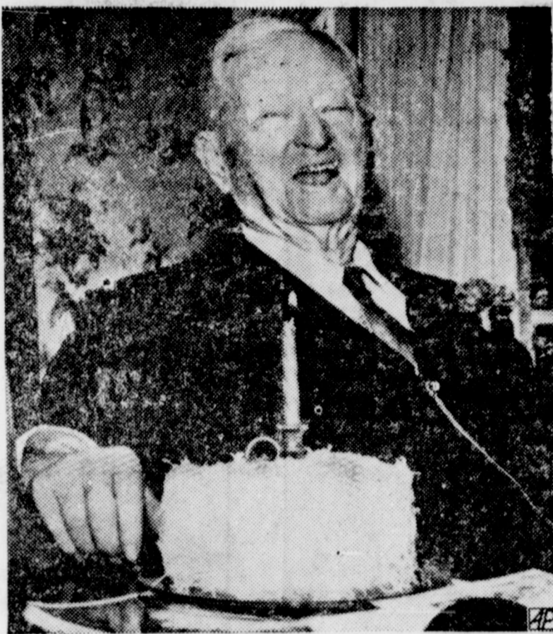
GARNER CELEBRATES BIRTHDAY - Former Vice President John Nance Garner had a big smile as the lone candle glowed on his birthday cake. Garner

Immediately after we receive your "SANTA-GRAM" we'll mail it direct to the North Pole so Old Santa and his Helpers can get everything fixed up for you to be delivered Christmas Eve Night. Now, don't forget, and HURRY, HURRY, HURRY!