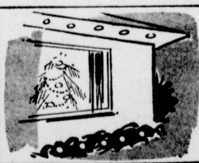
Frame your house with light, under eaves—at foundation line too.