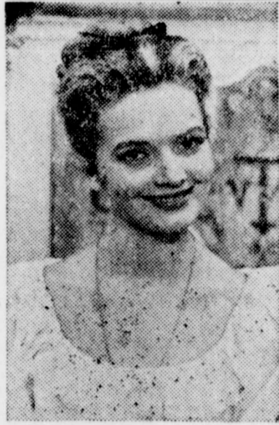
Star of the Rodgers and Hammerstein musical hit, "The Sound of Music," is lovely Florence Henderson, who plays the role of Maria. The show will be presented during the 1961 State Fair of Texas in Dallas, Oct. 7-22.