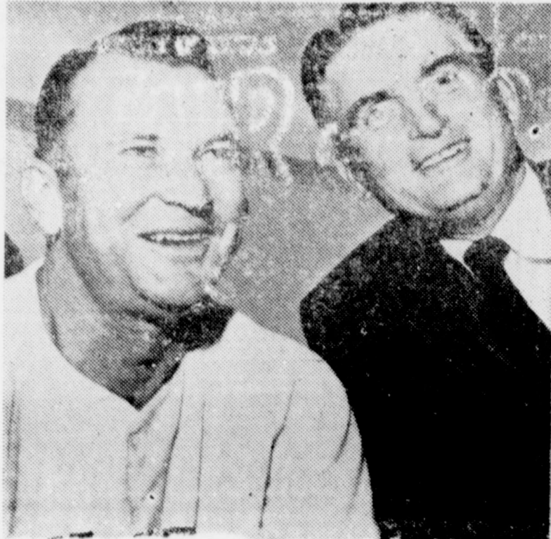
COLT MANAGER NAMED — Harry Craft, left, currently