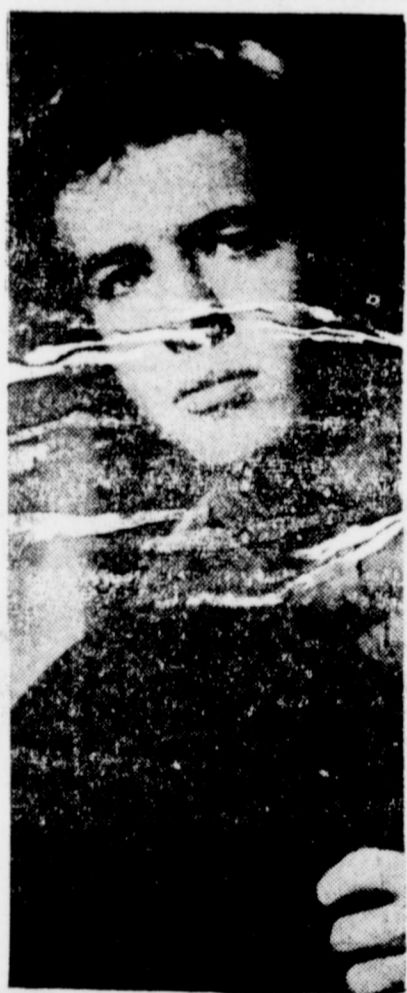
FAIR STAR —Handsome Clu Gulager, who plays Billy The Kid in the television series, "The Tall Man," will be guest star at the 1961 Heart O' Texas Fair and Podge in Waco, October 3-7. An Oklahoman and cousin of the late Will Rogers, Gulager is six feet tall, has blue eyes, brown hair.