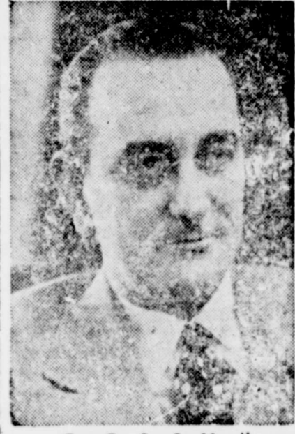
Out Or In, In Nov.!!