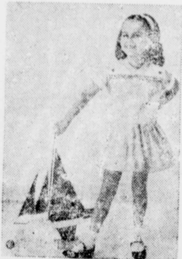
SEA MISS—In keeping with the new low-waisted look in mom's fashions is this nautical middy dress by Polly Flinders in Springmaid Everglaze cotton.