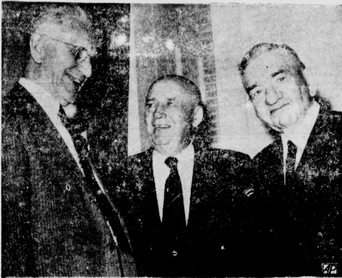
AFTER HOUSE VETO VOTE — Democratic leaders in the House get together outside the chamber in Washington D. C., after spearheading a successful drive to override President Eisenhower's veto of the second-try Public Works Appropriations Bill. Left to right: Rep. John McComack (D-Mass), House floor leader; House Speaker Sam Rayburn, and Rep. Clarence Cannon (D-Mo), chairman of the House Appropriations Committee. Similar Senate action followed the House vote as Congress overrode a White House veto for the first time in six years and eight months.