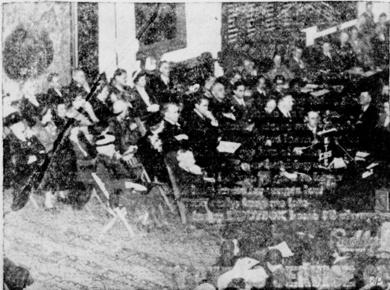
GOVERNOR DELIVERS ADDRESS