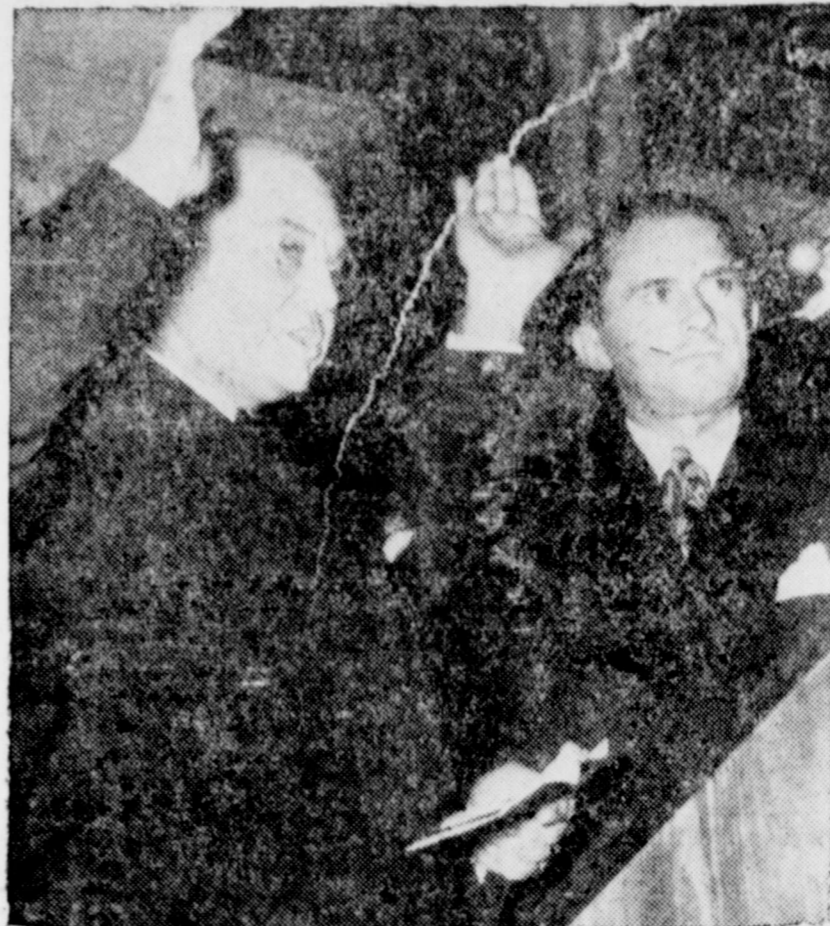
L.T. GOVERNOR SWORN IN