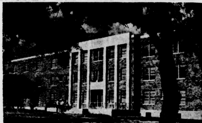
This three-story girls' dormitory at Hardin-Simmons University, Abilene, Texas, will be presented to the school by the American petroleum industry in a ceremony October 13 on the University campus in honor of the late Judge