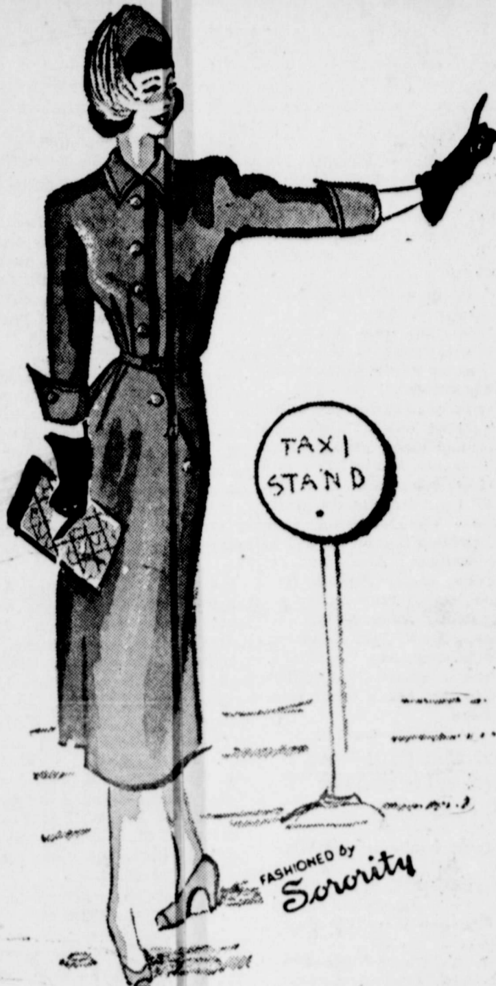
No. 7003 SMART SET