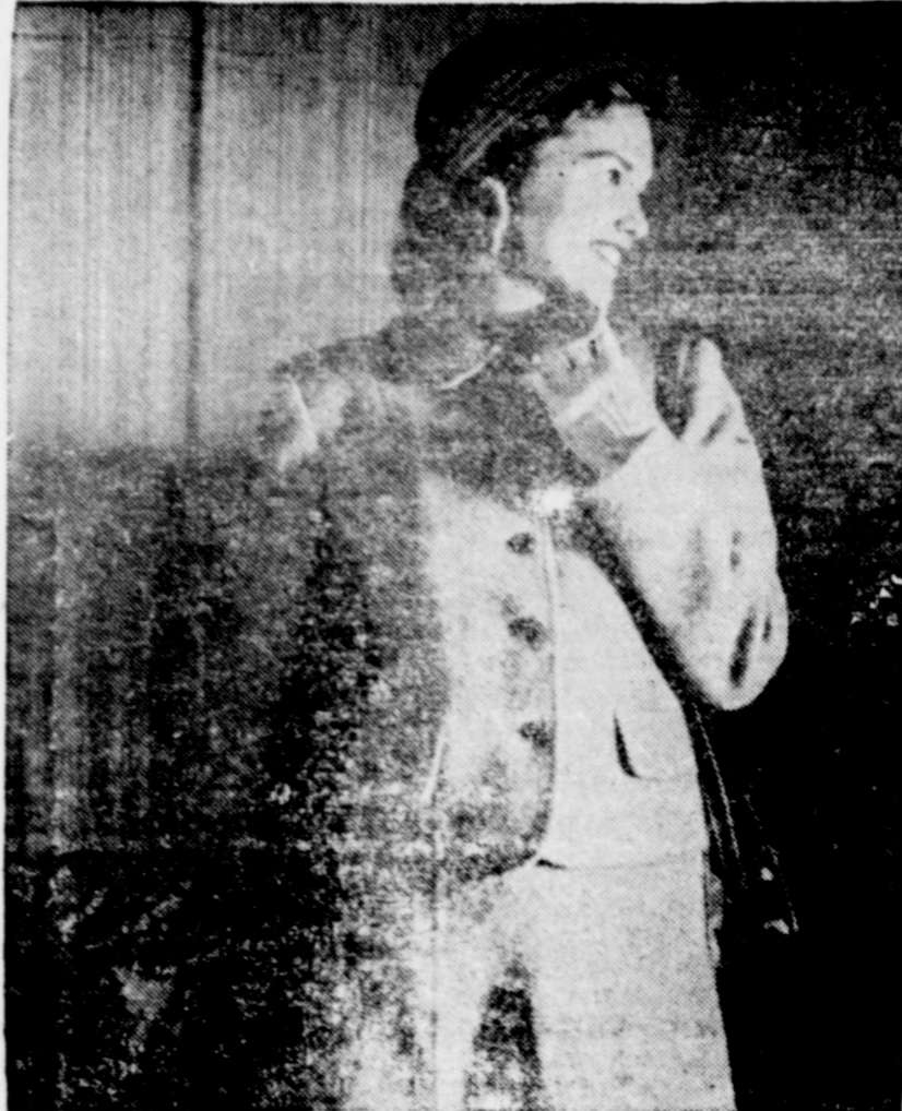
Today's teen agers insist that the new fashions make sense, and the new clothes are making a hit because they are not corny. Shown above is "the easiest tweed suit in the world," cut for fast travelling between soda fountain and study hall.