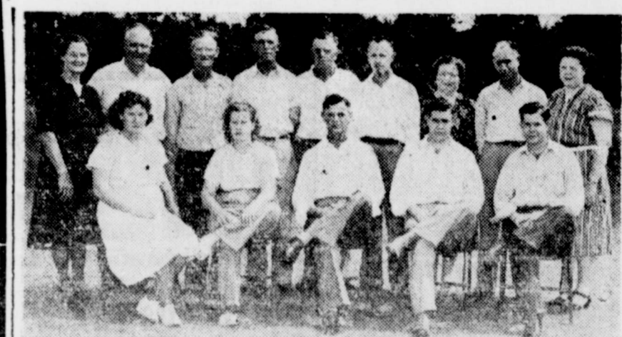
Here is a picture of the recent reunion of the Berry family: