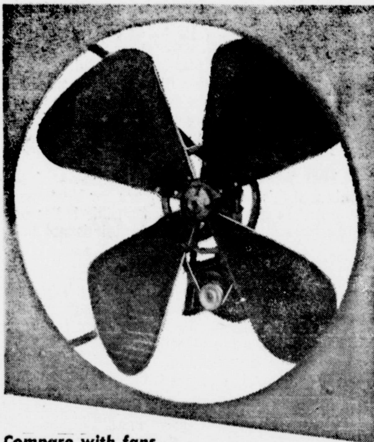
Compare with fans costing $100 or more!