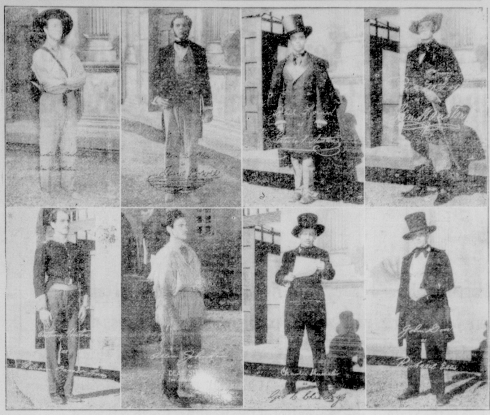
Dallas, Texas, July.—When the forty-foot rainbow colored water a hundred head of horses, Longhorns, burros, oxen and mustang ponies screen falls on the largest stage in the world at the Texas Centennial figure in this great Cavalcade of Texas, the biggest show at the Exposition, heroes of the past step from the pages of history to recreate the glamorous story of the birth of an empire. Three hundred actors, their names above genuine signatures of heroes of the Republic.