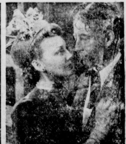
Beautiful Lila Regan (Virginia Grey), who loves him, comforts Alderson. She previously had quarreled with him but now she is filled with tenderness and pride.