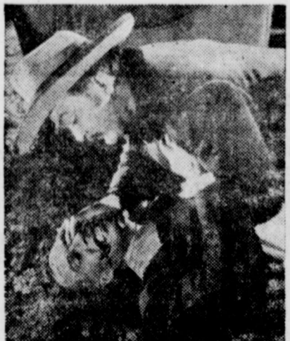
Charles Alderson (William Elliott), pioneer Wyoming cattle baron, fights vicious Duke Lassiter (Albert Dekker). With no holds barred, they go at each other savagely.

Vera Ralston and John Carroll star with Elliott in the picture.