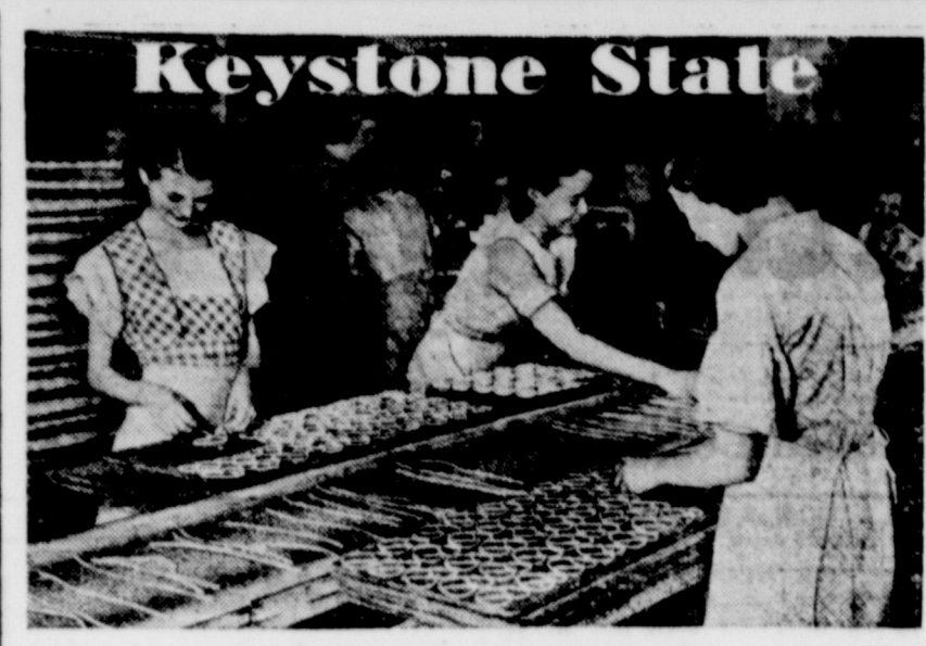
Pretzel Benders In a Reading Factory.

The burning of a white dog was an annual religious festival of the Indian tribes of Ohio. After a pure white dog was found, his legs were tied together so that he could be hung onto a pole that stretched between two forked posts stuck in the parents than in any other state of ground. Underneath the dog was the Union. It has nearly a million built a fire, and while the redskins more than New York, its closest yelled and danced around the prim- rival, although the total population itive altar, the animal would be of the Empire State is approxi-lowered to and then raised from the mately three million greater. In blaze. It was slowly tortured until fact, the people of native - white life was gone.