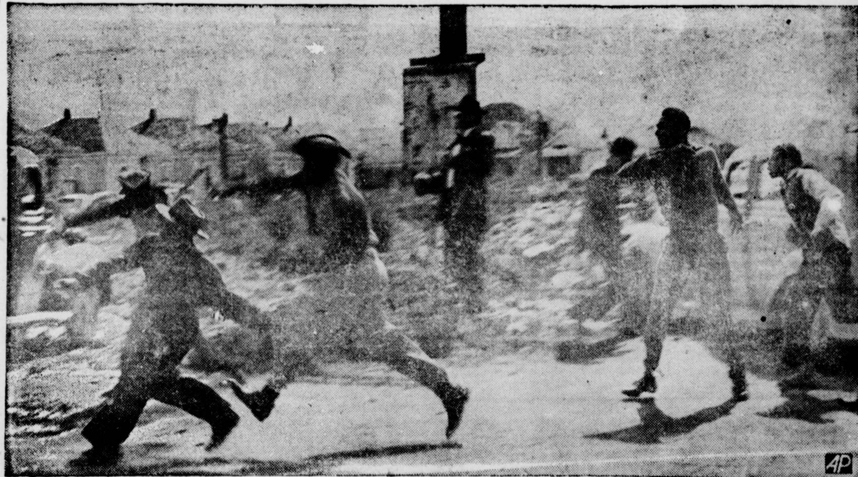
Bricks fly at Houston, Texas, in a strike of city employees. Police said that five newly recruited truck drivers were attacked with bricks and pieces of metal as they sought to leave the city garage. Striking employees are members of Hoisting Engineers Union, AFL, which includes workers from garbage, water, street maintenance, park departments, who seek wages increases of from 12 to 25 percent.