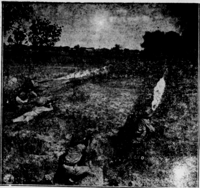
Released by U. S. War Department, Bureau of Public Relations.

HONORABLE HOT FOOT FOR JAPS —Two flamethrowing Chinese soldiers trained by U. S. Chemical Warfare Service troops in the use of the CWS portable flamethrower, learn the tactical mission of the weapon—that of destroying enemy pillboxes and bunkers.