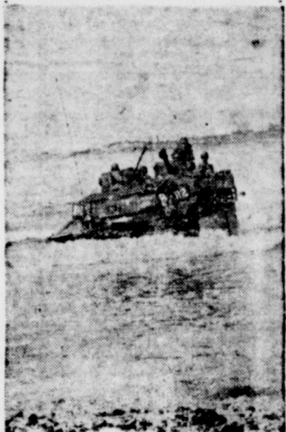
Byukyu Lan...ng. The War Bonds you buy provide funds for building LVT's such as this one swimming in to drive the Japs from another important Pacific island. U. S. Treasury Department