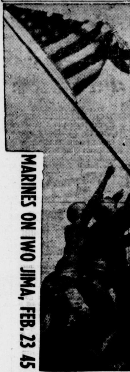
MARINES ON IWO JIMA, FEB. 23 45