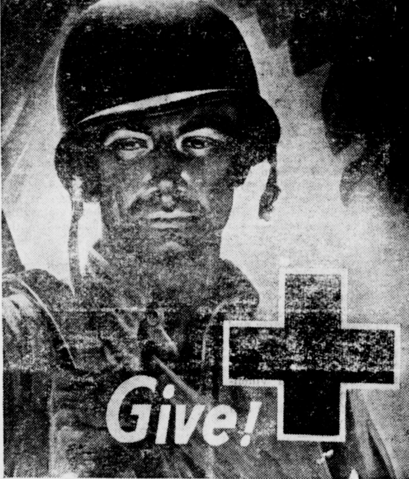
Through the Red Cross the American people serve the men of their Army, Navy, Marine Corps and Coast Guard.

"The Mother Away From Home" Needs No Introduction To The American People Give So Some Dear One Won't Hurt So Much!