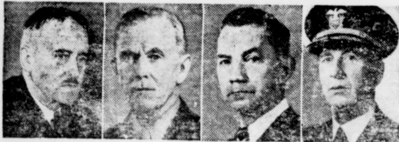
Stimson Gen. Marshall Forrestal Adm. King

and educational, religious, fraternal, industrial and labor groups pledged unstinting support.