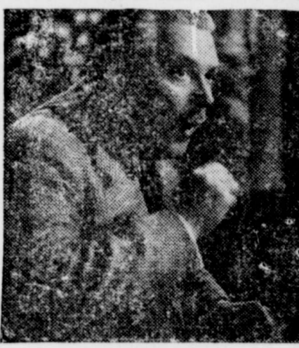
I knew that Rebecca was uppermost in their thoughts.

I remember quite clearly the wave of annoyance which swept across Maxim's face when we entered the great hall of Manderley. The butler, Frith, had hurried down the front steps to meet us, and we had followed him to the huge first room of the house, where we were confronted with some twenty servants of the household, assembled to meet us. I was wet, and painfully conscious of my appearance before them all. I heard Maxim say, to Frith: "I didn't expect the whole staff to be in attendance," and Frith's quiet reply, "Mrs. Danvers' orders, sir."