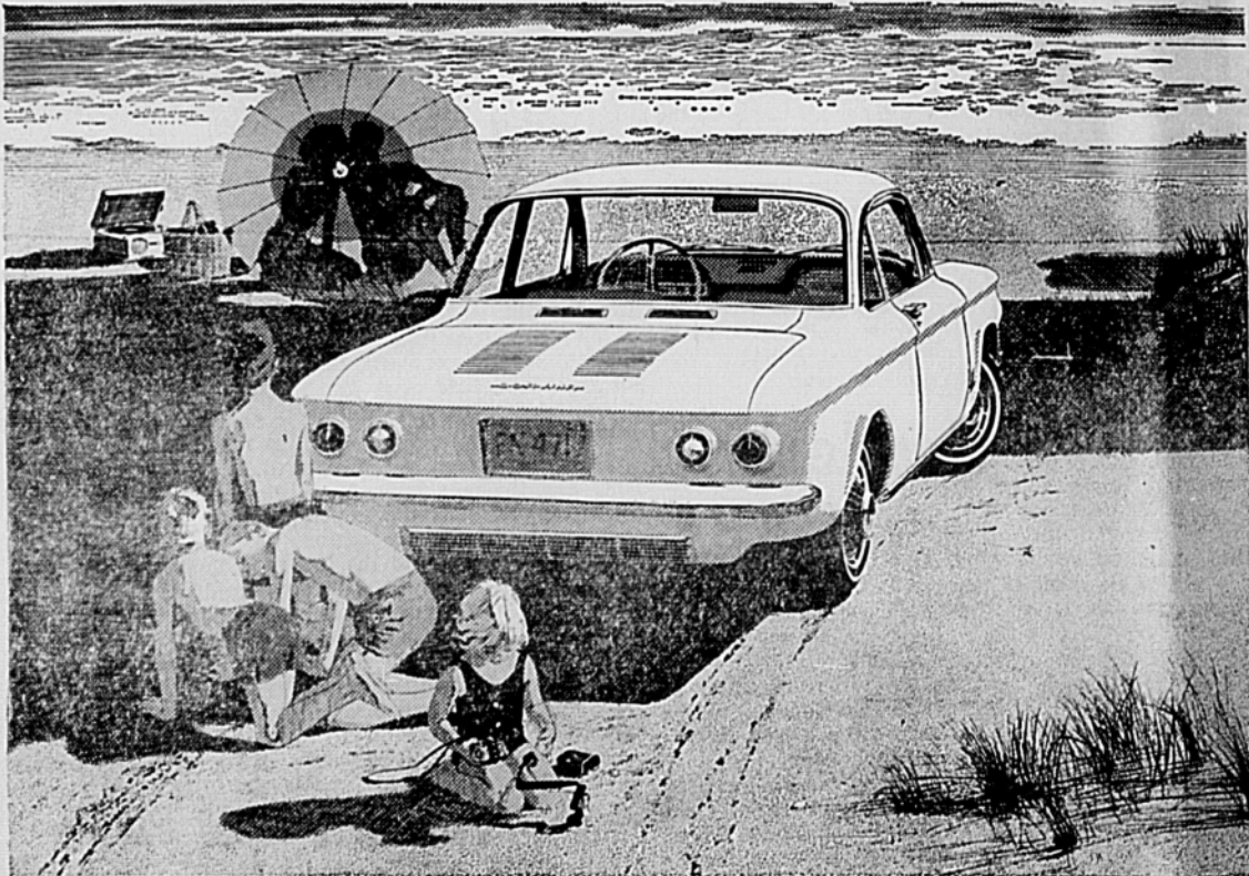
Corvair Monza Club Coupe

Sealed proposals will be received by the Housing Authority of the City of Baird, Texas, (hereinafter called the "Local Authority") at 344 Market Street (P. O. Box 1178) in the City of Baird, Texas, until, and publicly opened at eleven o'clock A.M. (C.S.T.) on May 14, 1963, for the purchase of $178,000.00 Temporary Notes (Second Series), being issued to aid in financing its low-rent housing project. The notes will be dated June 11, 1963, will be payable to bearer on August 9, 1963, and will bear interest at the rate or rates per annum fixed in the proposal or proposals accepted for the purchase of such notes. All proposals for the purchase of said notes shall be submitted in a form approved by the Local Authority. Copies of such form of proposals and information concerning the notes may be obtained from the Local Authority at the address indicated above. 18-1-c