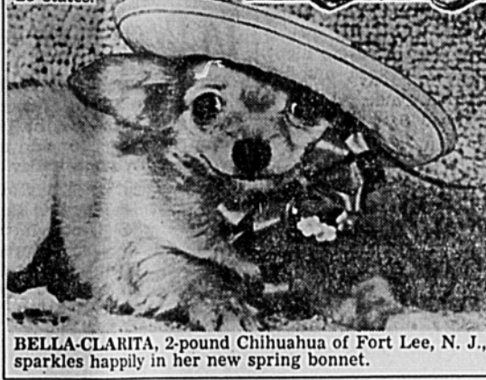
BELLA-CLARITA , 2-pound Chihuahua of Fort Lee, N. J., sparkles happily in her new spring bonnet.