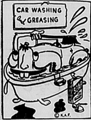
"Come on in, the washin's fine."

Car washing and lubrication are specialized services with us. We have the right lubricant and we KNOW where it should go. When we wash your car we CLEAN IT inside and out.