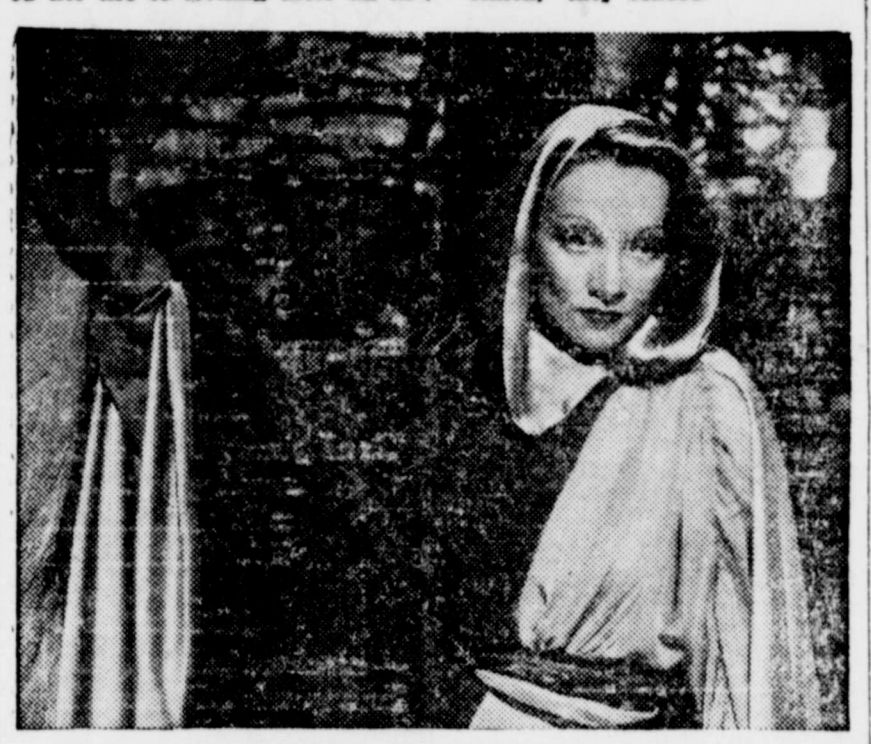
She stood on the balcony outside her room, drinking in the beauty of the African evening.

"Oremus," he announced. Benedic, Domine, nos et haec tua dona, quae de tua largitate sumus sumpturi. Per Christum Dominum nostrum." "Amen," they echoed.