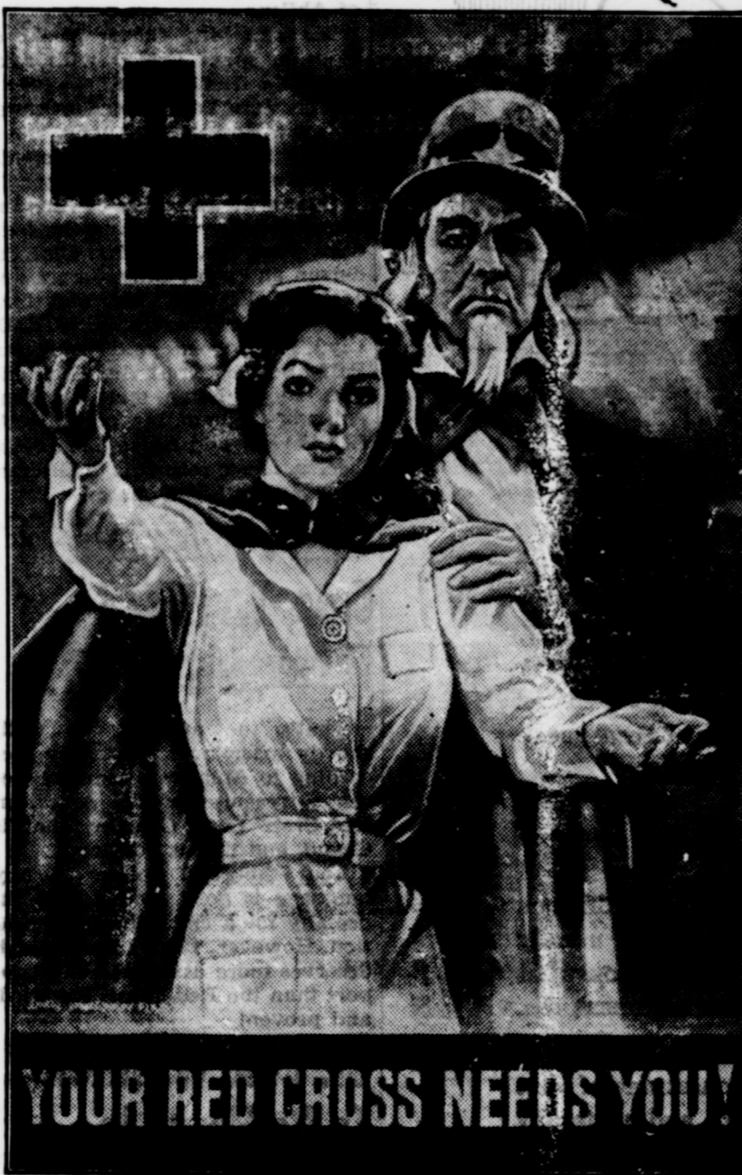
First war poster of the new World War, painted by the distinguished artist James Montgomery Flagg, carries an appeal for a $50,000,000 war fund to aid the victims of aggression upon the United States and its island possessions.