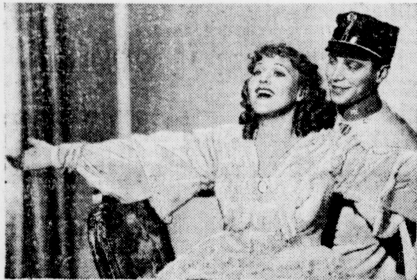
Francis watched her, and as she finished the song, crushed her into his arms. (Posed by Grace Moore and Franchot Tone)