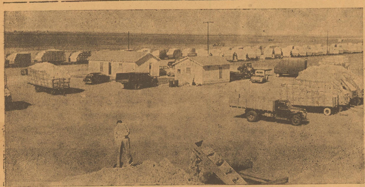
Typical gin yard scene is this one taken near narvest peak at the gin south of Hub.