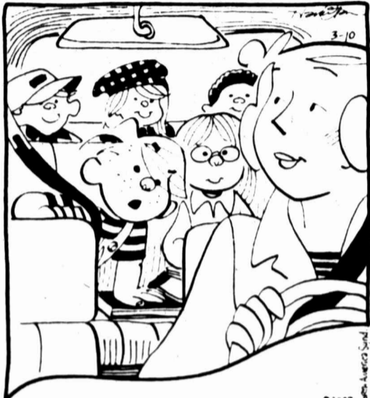
"SINCE THIS IS A CARPOOL, ARE YOU THE LIFEGUARD, MOM?"