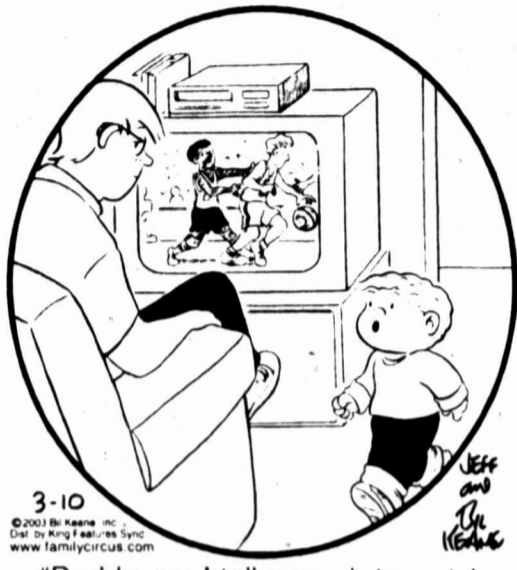
"Daddy, am I tall enough to watch basketball?"