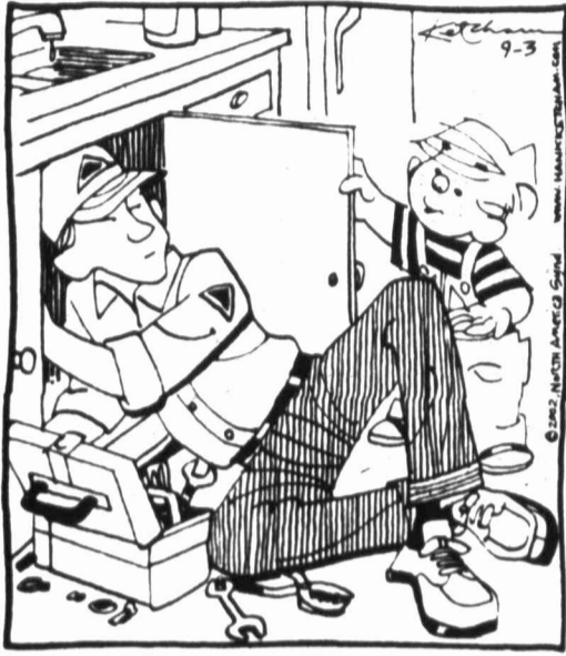
"AFTER YOU'RE FINISHED WITH THAT, COULD YOU FIX MY SUPER-TURBO WATER-SQUIRTER?"